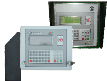
Simple Retrofit to existing systems

Replace the door and enter a new generation of fuel management !.